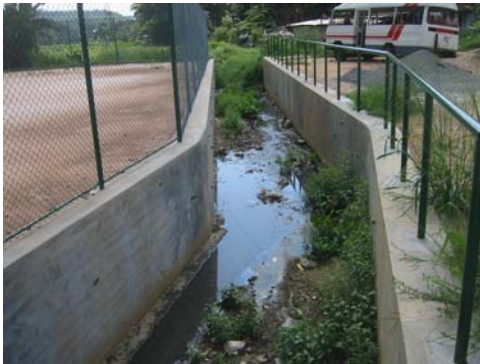
Snap – 8