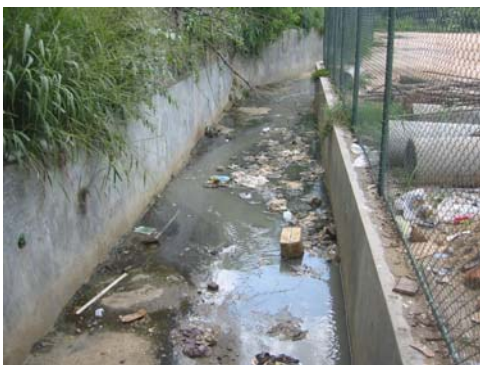
Snap – 9