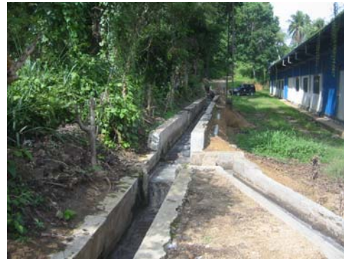
Snap – 11