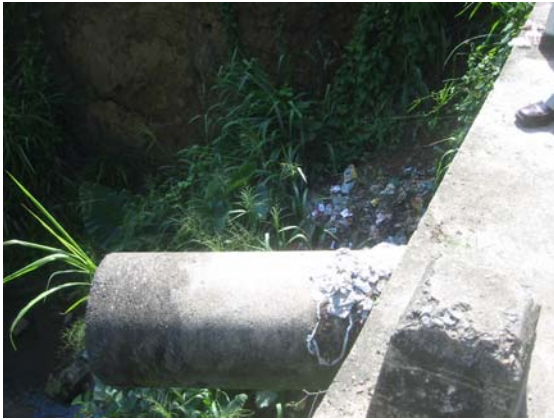
Snap - 2