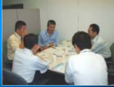
Discussion on water resources engineering