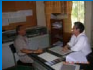
Solo river basin office