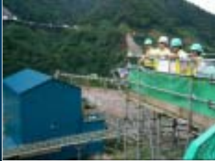
Tokuyama Dam Construction Works