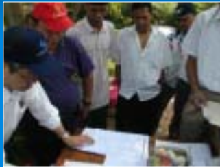
Discussion at the field site