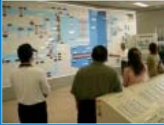
Tone Canal Control Center