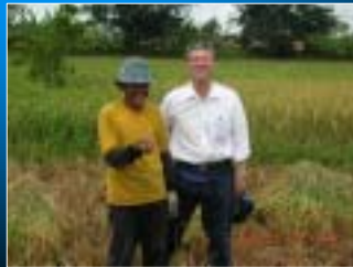
With a farmer