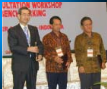
Exchange Agreement of personnel between JWA and PJT and PJT