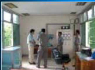
Dam maintenance office