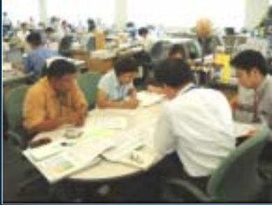
explanation on outline of JWA