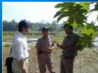
Disposal area for dredging