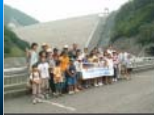
Participation in Public Awareness Event