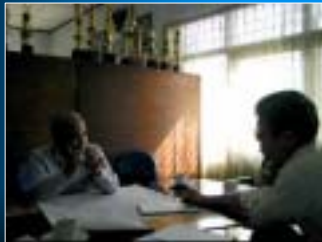
At the PJT office