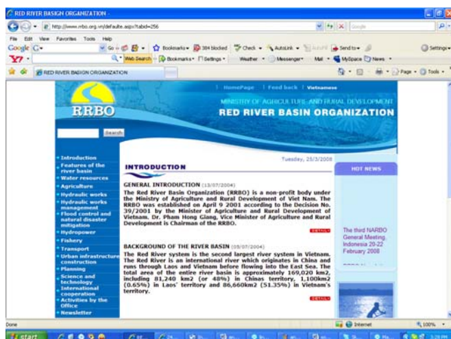
Website of RRBO