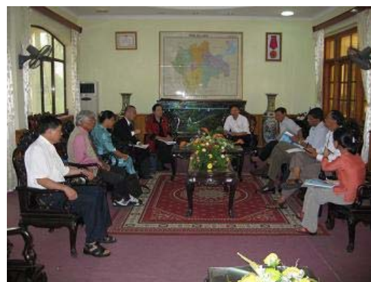
NARBO Peer Reviewers working with Day Sub-RBO