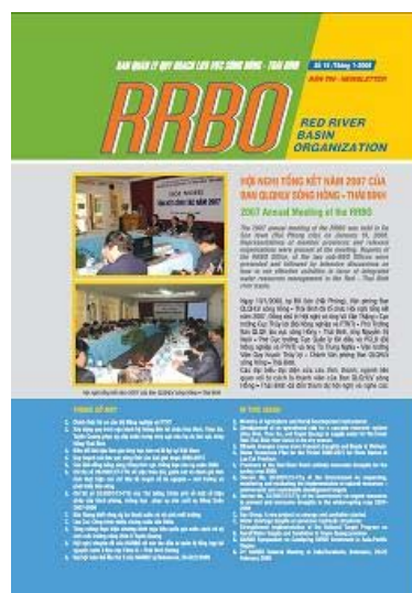
RRBO newsletter issue 16