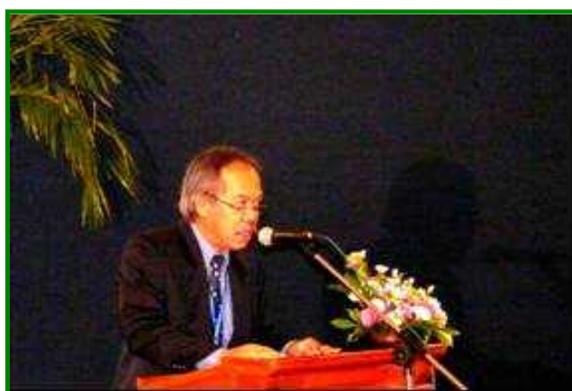
Address by the Chairperson