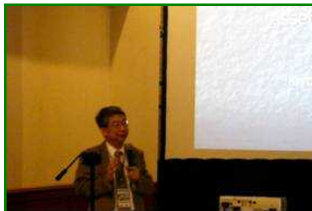
Presentation in the Workshop