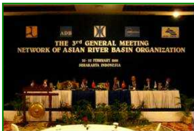
Panel Discussion in the Workshop