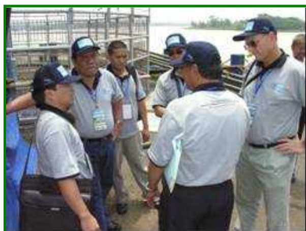
Discussion at Wonogiri Reservoir