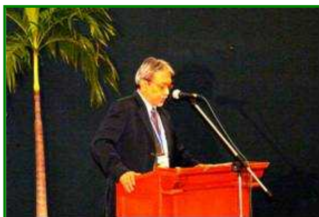
Address by the incoming Chairperson