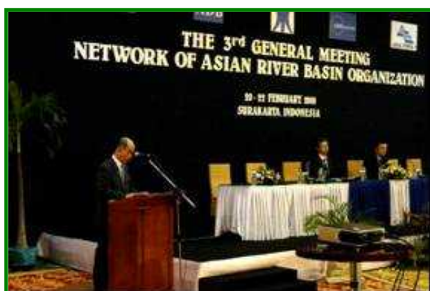
Report by the Secretary General