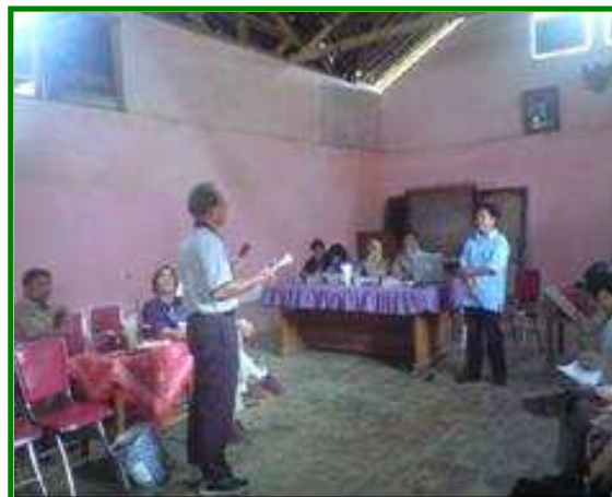
Dialogue with the stakeholders