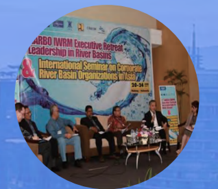
1st NARBO IWRM Executive Retreat on Leadership in River Basins (Indonesia)

NARBO conducted international conferences such as '1st NARBO IWRM Executive Retreat on Leadership in River Basins' and 'NARBO International Seminar on Corporate RBOs in Asia' in 2011. Intensive discussions were made among high level officials, RBO leaders and water champions. Basically, we agreed that i) Importance of good leadership and the value of dialogue and networking; and ii) Necessity of better documentation of experiences of basin-level IWRM in Asia and working together through NARBO in sharing knowledge and good practices.