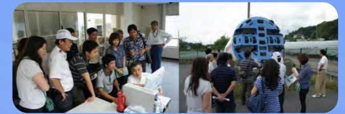
Field trip in Twinning Program (Japan)

NARBO's Twinning Program is a program to exchange staff among members to exchange information and experiences among members for improving water resources management. This program is very useful in exchanging technology and sharing practical solution on IWRM. Twinning Program is one of the features of NARBO activities.