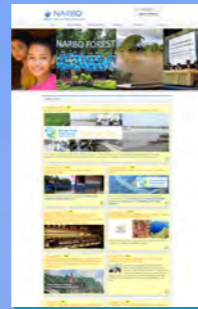
Web Site http://www.narbo.jp/