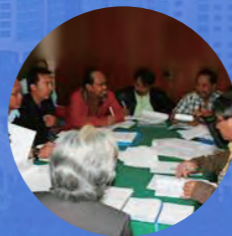
Workshop on Performance Benchmarking

To stimulate performance improvement of RBOs and allow practical exchange of experience, Performance Benchmarking is carried out among NARBO members using on-line database and web interface for a NARBO Benchmarking Service are being developed.