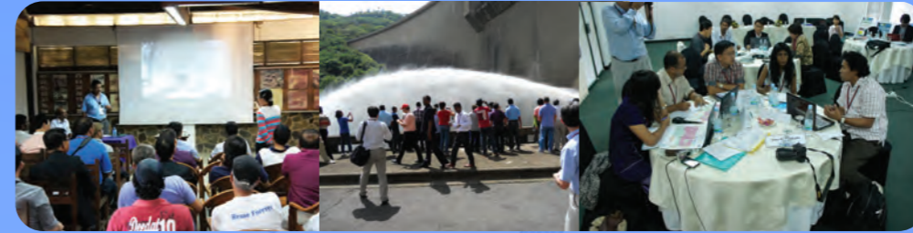
The 7th IWRM Training (Sri Lanka)

Training courses are organized for capacity development of RBOs in implementing IWRM among member organizations. Since 5th Training in Viet Nam, NARBO has been using "IWRM Guidelines at River Basin Levels" which was launched by UNESCO in 2009 as a main training textbook. Outcomes of the training have been contributed to establish IWRM plan in their river basins.