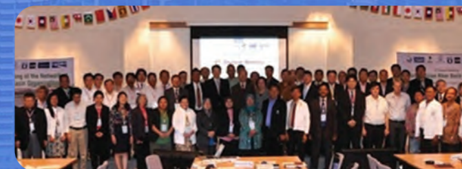
The 5th General Meeting (Thailand)

NARBO General Meeting is held in every two years, and reviews the past two years activities and approves new action program and Management Team. Workshop and Study Visit to look for solutions on specific topics are also held. It is also an important opportunity to share knowledge and experience of each member organization and make the best use of the consultation to Knowledge Partners.