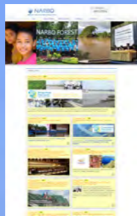
Web Site http://www.narbo.jp/