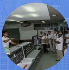
Study visit in Thematic Workshop

Thematic Workshops are organized in response to member's needs for NARBO activities, focusing on the specific themes. We have conducted workshops on Water Allocation and Water Rights, Sustainable Management for Water Resources Infrastructures and Water-Related Disaster and its Management. Action programs which were summarized at each workshop as a result of the workshop were proposed to each organization, and it was incorporated into their activities.