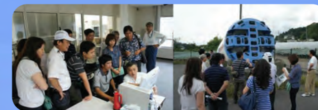
Field trip in Twinning Program (Japan)

NARBO's Twinning Program is a program to exchange staff among members to exchange information and experiences among members for improving water resources management. This program is very useful in exchanging technology and sharing practical solution on IWRM. Twinning Program is one of the features of NARBO activities.