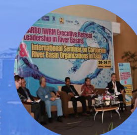
1st NARBO IWRM Executive Retreat on Leadership in River Basins (Indonesia)

NARBO conducted international conferences such as '1st NARBO IWRM Executive Retreat on Leadership in River Basins' and 'NARBO International Seminar on Corporate RBOs in Asia' in 2011. Intensive discussions were made among high level officials, RBO leaders and water champions. Basically, we agreed that i) Importance of good leadership and the value of dialogue and networking; and ii) Necessity of better documentation of experiences of basin-level IWRM in Asia and working together through NARBO in sharing knowledge and good practices.