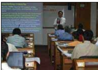
Photo10. At the lecture (Bangkok)

The First training course on IWRM was held in Bangkok and Chiang Mai from July 26 to August 6 in Thailand with a great contribution from Thailand Water Resources Association (TWRA). The training course consisted of two parts. The former was held in Bangkok from July 26 to July 31 and consisted of lectures. The latter one was held in Chiang Mai from August 2 to August 6 and consisted of many site visits.