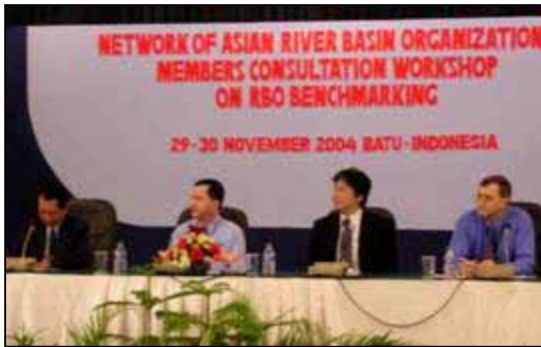
Photo13. Facilitators at the session