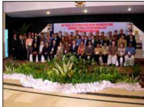
Photo14. Group photo