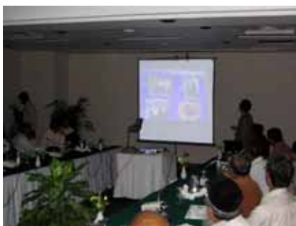
Photo17. Presentation by NARBO Secretariat

Organization/Area Water Partnership” session on July 14. The secretariat also distributed NARBO newsletters and advertised NARBO. During the forum, some of the participants asked him what to do to become its member.