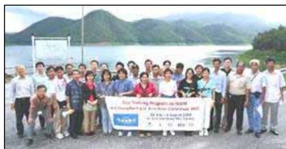
Photo12. At site visit (At Mae Kuang Dam, Chiang Mai)

assignments and group assignments (five groups). On the last day of training in Chiang Mai, all participants made presentations about their assignments and each group also did the same thing. After all presentations finished, according to the rating by secretariat, three individuals and one group were awarded.