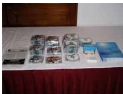
Photo18. Exhibition for NARBO promotion