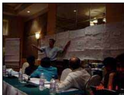
Photo 9. Discussion on necessary contents