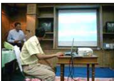
Photo11. Group presentation (Chiang Mai)

Especially in Chiang Mai, as participants went out to visit the sites in the morning and