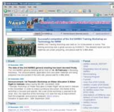
Web-site ( http://www.narbo.jp/ )