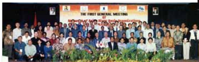
The 1st NARBO General Meeting