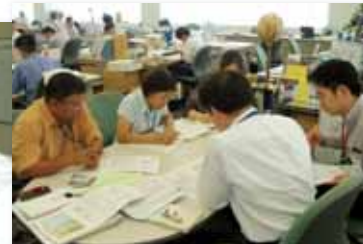
At work in the office

NARBO promotes both practical discussion and field activities.