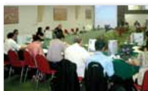
Workshop on Performance Benchmarking

To stimulate performance improvement of RBOs and allow practical exchange of experience, Performance Benchmarking is carried out among NARBO members. On-line database and web interface for a NARBO Benchmarking Service are being developed.