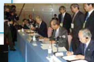
The 3rd World Water Forum