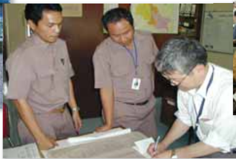
Discussion on water management technology