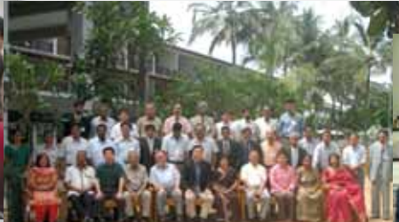
The 2nd Training Course in Sri Lanka