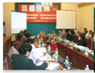
Thematic Workshop on Water Allocation and Water Right

Thematic Workshops are organized in response to members' needs for NARBO activities, focusing on the specific themes. The workshops are carried out with a small group of participants to deepen discussion.