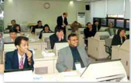
The 3rd Training Course in Korea