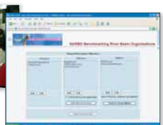
NARBO Benchmarking Service