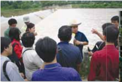
The 1st Training Course in Thailand

Training courses are organized for capacity development of RBOs in implementing IWRM among member organizations. Various training resources on IWRM are provided with taking advantage of a network.