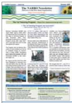
NARBO News Letter

NARBO provides information on IWRM in river basins throughout Asia, such as good practices and lessons learned, are provided.