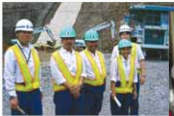
Visiting dam construction

NARBO's Twinning Program promotes the adoption of good practices by other members and to exchange information among members for the improvement of water resources management. To facilitate closer relations among NARBO members, the program includes information exchange, staff exchange and exchange visit.