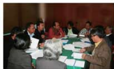
Workshop on Performance Benchmarking

To stimulate performance improvement of RBOs and allow practical exchange of experience, Performance Benchmarking is carried out among NARBO members. On-line database and web interface for a NARBO Benchmarking Service are being developed.