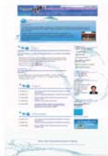
Web-site [ http://www.narbo.jp/ ]