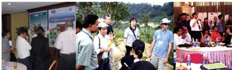
The 5th IWRM Training (Viet Nam)

Training courses are organized for capacity development of RBOs in implementing IWRM among member organizations. Since 5th Training in Viet Nam, NARBO has been using "IWRM Guidelines at River Basin Levels" which was launched by UNESCO in 2009 as a main training textbook. Outcomes of the training have been contributed to establish IWRM plan in their river basins.