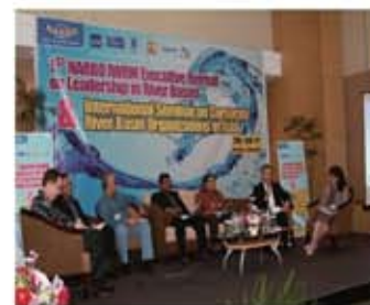
1st NARBO IWRM Executive Retreat on Leadership in River Basins (Indonesia)

NARBO conducted international conferences such as '1st NARBO IWRM Executive Retreat on Leadership in River Basins' and 'NARBO International Seminar on Corporate RBOs in Asia' in 2011. Intensive discussions were made among high level officials, RBO leaders and champions. Basically, we agreed that i) Importance of good leadership and the value of dialogue and networking; and ii) Necessity of better documentation of experiences of basin-level IWRM in Asia and working together through NARBO in sharing knowledge and good practices.