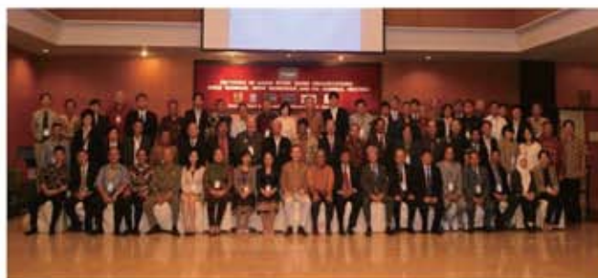
The 4th General Meeting (Indonesia)

NARBO General Meeting is held in every two years, and review the past two years activities and approve new action program and Management Team. Workshop and Study Visit to look for solutions on specific topics are also held. It is also an important opportunity to share knowledge and experience of each member organization and make the best use of the consultation to Knowledge Partners.