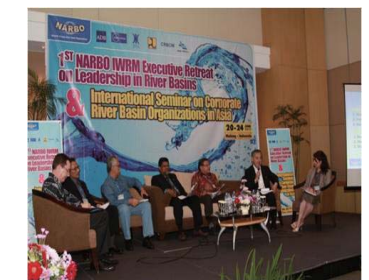
1st NARBO IWRM Executive Retreat on Leadership in River Basins (Indonesia)

NARBO conducted international conferences such as '1st NARBO IWRM Executive Retreat on Leadership in River Basins' and 'NARBO International Seminar on Corporate RBOs in Asia' in 2011. Intensive discussions were made among high level officials, RBO leaders and champions. Basically, we agreed that i) Importance of good leadership and the value of dialogue and networking; and ii) Necessity of better documentation of experiences of basin-level IWRM in Asia and working together through NARBO in sharing knowledge and good practices.