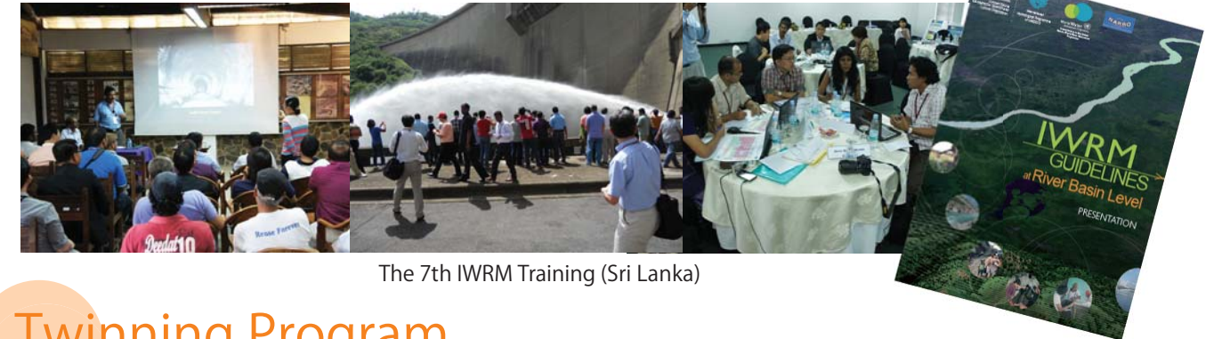
The 7th IWRM Training (Sri Lanka)

Training courses are organized for capacity development of RBOs in implementing IWRM among member organizations. Since 5th Training in Viet Nam, NARBO has been using "IWRM Guidelines at River Basin Levels" which was launched by UNESCO in 2009 as a main training textbook. Outcomes of the training have been contributed to establish IWRM plans in their river basins.