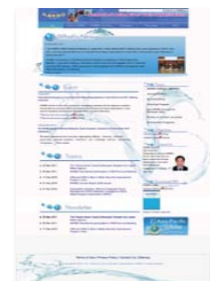
Web-site [ http://www.narbo.jp/ ]