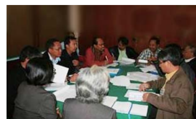
Workshop on Performance Benchmarking

To stimulate performance improvement of RBOs and allow practical exchange of experience, Performance Benchmarking is carried out among NARBO members. On-line database and web interface for a NARBO Benchmarking Service are being developed.