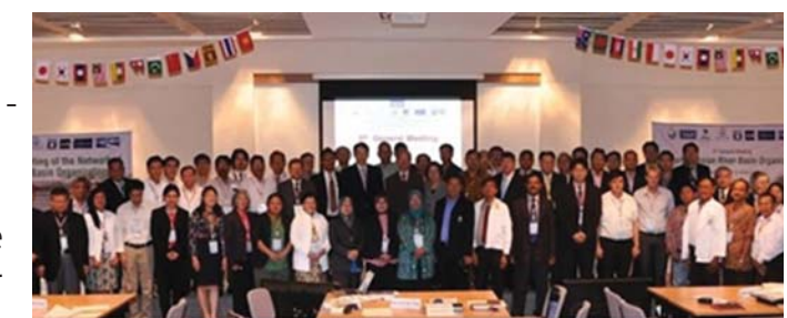
The 5th General Meeting (Thailand)

NARBO General Meeting is held in every two years, and review the past two years activities and approve new action program and Management Team. Workshop and Study Visit to look for solutions on specific topics are also held. It is also an important opportunity to share knowledge and experience of each member organization and make the best use of the consultation to Knowledge Partners.