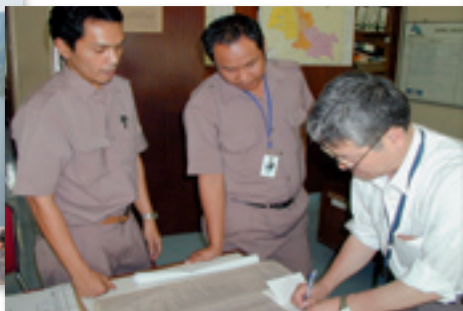
Discussion on water management technology