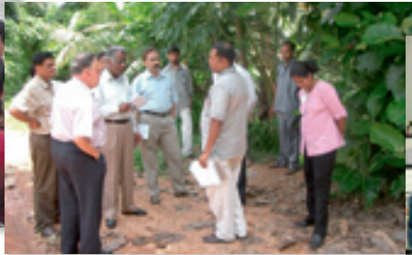
The 2nd Training Course in Sri Lanka