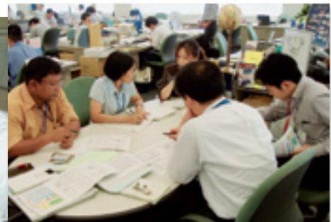
At work in the office

NARBO promotes both practical discussion and field activities.