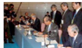
The 3rd World Water Forum