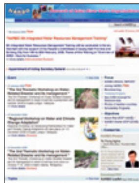
Web-site ( http://www.narbo.jp/ )