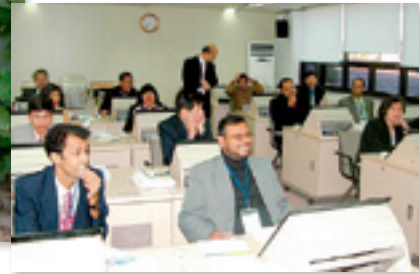
The 3rd Training Course in Korea