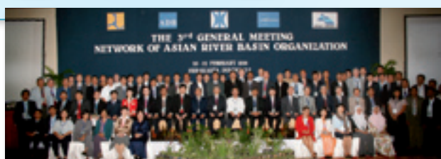
The 3rd NARBO General Meeting (Feb2008)