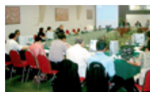
Workshop on Performance Benchmarking

To stimulate performance improvement of RBOs and allow practical exchange of experience, Performance Benchmarking is carried out among NARBO members. Workshops are carried out, and on-line database and web interface for a NARBO Benchmarking Service are being developed.