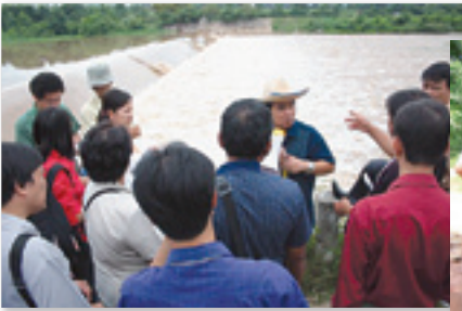
The 1st Training Course in Thailand

Training courses are organized for capacity development of RBOs in implementing IWRM among member organizations. Various training resources on IWRM are provided with taking advantage of a network.