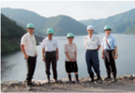
Visiting dam reservoir

NARBO's Twinning Program promotes the adoption of good practices by other members and to exchange information among members for the improvement of water resources management. To facilitate closer relations among NARBO members, the program includes information exchange, staff exchange and exchange visit.