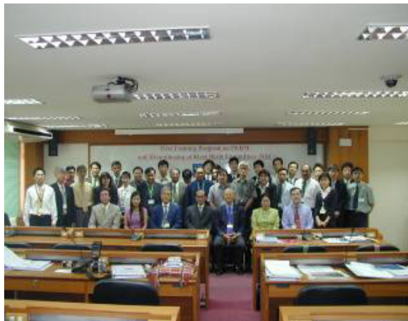
All of participants (Bangkok)

In the second week, from August 1 to 6, the participants visited different kinds of water management projects in Chiang Mai. There, the participants were able to witness the actual water management operations of a various dams and through the discussions and interactions with the technical and management staff gained knowledge on their field experiences. The participants visited about two to three projects per day. After they got back from site visits, participants and the secretariat had the meeting to discuss what they had seen and observed during the site visits. They tried to identify the key issues,