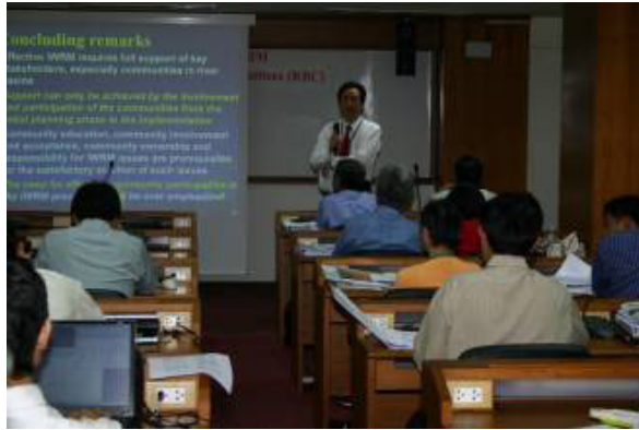
Lecture in Irrigation development institute (Bangkok)