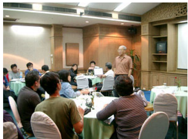
Discussion after getting back from site visit

In the training course, the participants were asked to write an individual report and a group report. In the individual report, the participants had to summarize what they had learned, the strategies and the action plan on how they would put IWRM into practice in their own organization or country. For making group reports, the participants made five groups and each group was designated the different theme to write about.