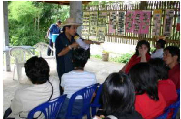
Lecture at the field visit site (Chiang Mai)

strong and weak points in the operations and IWRM elements embedded the projects visited. These meeting lasted to late at night every day.