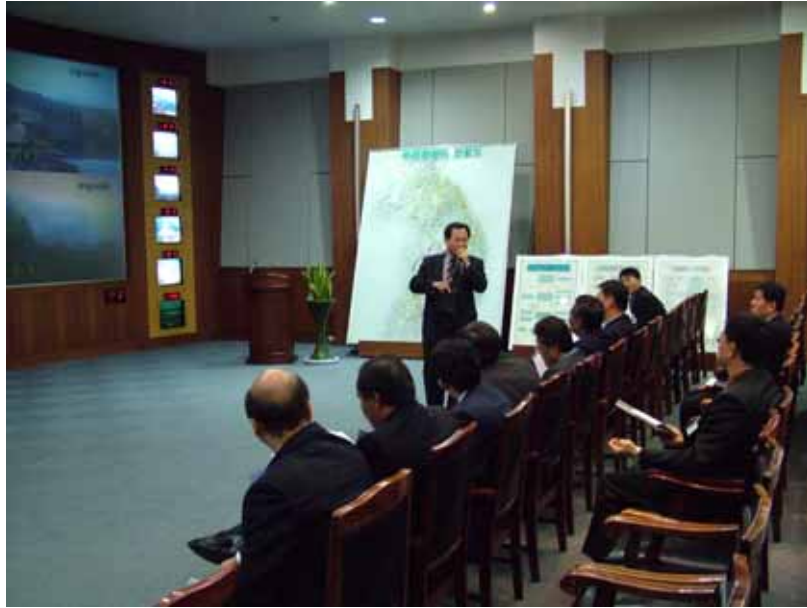
<Director of KOWACO Water Operation Center gave the Indonesian delegates an overview of the situation and management of water resources in Korea>