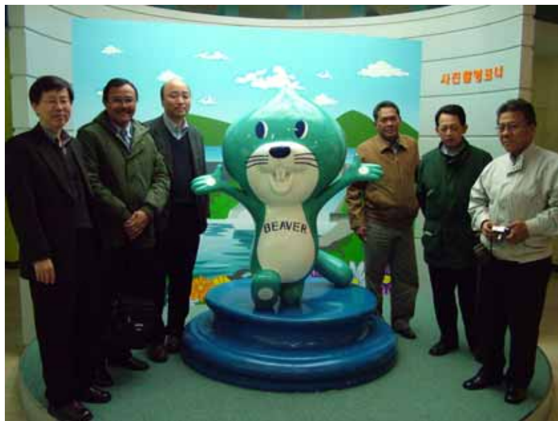
<A Yongdam Multipurpose Dam>