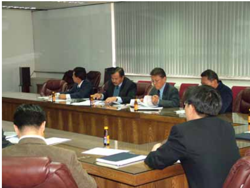
< Indonesian Delegates examining the information on the river basins >