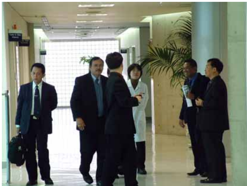
<Indonesian delegates visiting the International Drinking Water Analysis Center >