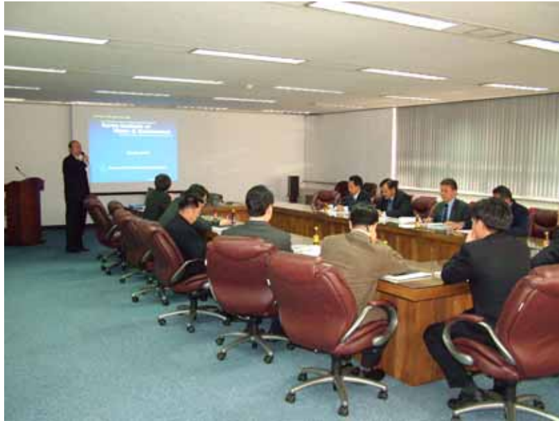
< Meeting between Indonesian delegates and KOWACO Staff members >