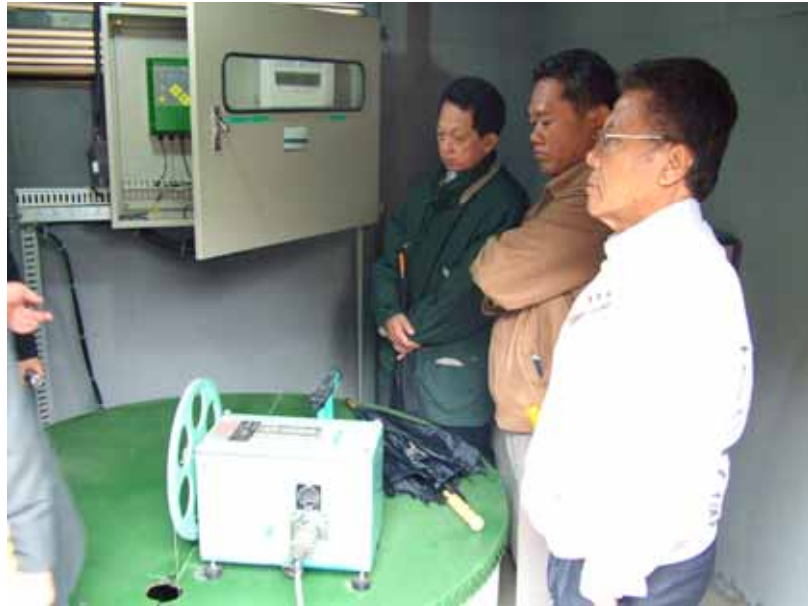
<At a remotely monitored flow observation station in the basin>