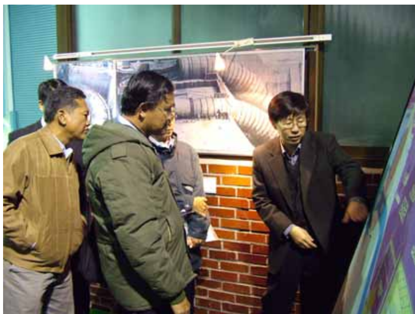
<Director Ko explains the main features of the hydropower generation facility at Daecheong Multipurpose Dam>

On March 15, 2005, we visited a number of sites (Daecheong Multipurpose Dam, Monitoring stations, Yongdam Multipurpose Dam) in Geum River Basin managed by KOWACO.