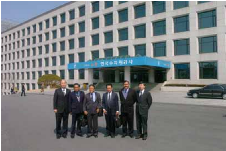
<Delegates in front of the KOWACO main office>

In the morning of 15 th , we visited the main office of KOWACO and took a tour to major facilities including the state-of-art Water Resources Control Center, the International Drinking Water Analysis Center of KOWACO.