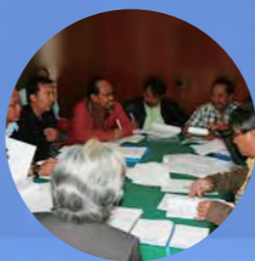
Workshop on Performance Benchmarking

To stimulate performance improvement of RBOs and allow practical exchange of experience, Performance Benchmarking is carried out among NARBO members using on-line database and web interface for a NARBO Benchmarking Service are being developed.