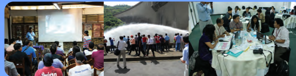
The 7th IWRM Training (Sri Lanka)

Training courses are organized for capacity development of RBOs in implementing IWRM among member organizations. Since 5th Training in Viet Nam, NARBO has been using "IWRM Guidelines at River Basin Levels" which was launched by UNESCO in 2009 as a main training textbook. Outcomes of the training have been contributed to establish IWRM plan in their river basins.