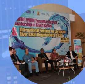
1st NARBO IWRM Executive Retreat on Leadership in River Basins (Indonesia)

NARBO conducted international conferences such as '1st NARBO IWRM Executive Retreat on Leadership in River Basins' and 'NARBO International Seminar on Corporate RBOs in Asia' in 2011. Intensive discussions were made among high level officials, RBO leaders and water champions. Basically, we agreed that i) Importance of good leadership and the value of dialogue and networking; and ii) Necessity of better documentation of experiences of basin-level IWRM in Asia and working together through NARBO in sharing knowledge and good practices.