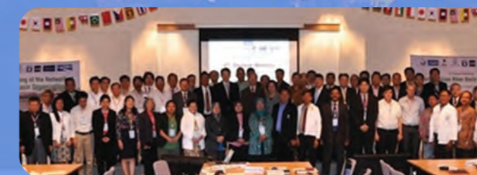
The 5th General Meeting (Thailand)

NARBO General Meeting is held in every two years, and reviews the past two years activities and approves new action program and Management Team. Workshop and Study Visit to look for solutions on specific topics are also held. It is also an important opportunity to share knowledge and experience of each member organization and make the best use of the consultation to Knowledge Partners.