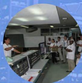
Study Visit in Thematic Workshop

Thematic Workshops are organized in response to member's needs for NARBO activities, focusing on the specific themes. We have conducted workshops on Water Allocation and Water Rights, Sustainable Management for Water Resources Infrastructures and Water-Related Disaster and its Management. Action programs which were summarized at each workshop as a result of the workshop were proposed to each organization, and it was incorporated into their activities.