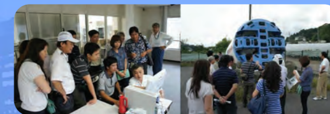
Field trip in Twinning Program (Japan)

NARBO's Twinning Program is a program to exchange staff among members to exchange information and experiences among members for improving water resources management. This program is very useful in exchanging technology and sharing practical solution on IWRM. Twinning Program is one of the features of NARBO activities.