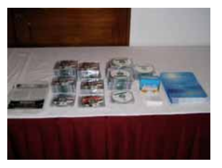
Photo18. Exhibition for NARBO promotion

Organization/Area Water Partnership" session on July 14. The secretariat also distributed NARBO newsletters and advertised NARBO. During the forum, some of the participants asked him what to do to become its member.