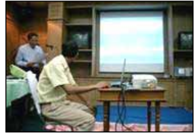
Photo11. Group presentation (Chiang Mai)

Especially in Chiang Mai, as participants went out to visit the sites in the morning and