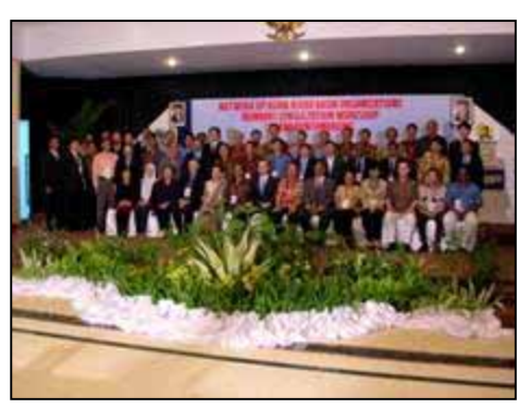
Photo14. Group photo