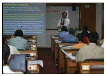
Photo10. At the lecture (Bangkok)

The First training course on IWRM was held in Bangkok and Chiang Mai from July 26 to August 6 in Thailand with a great contribution from Thailand Water Resources Association (TWRA). The training course consisted of two parts. The former was held in Bangkok from July26 to July 31 and consisted of lectures. The latter one was held in Chiang Mai from August 2 to August 6 and consisted of many site visits.