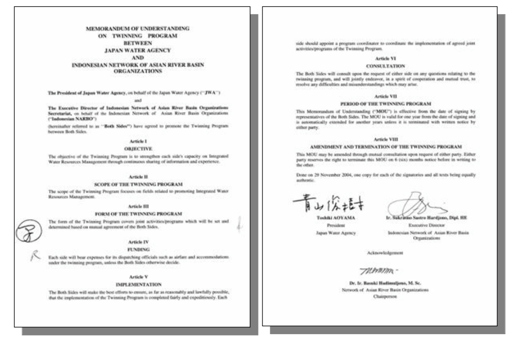
Signed memorandum of understanding

About the full size of the memorandum of understanding, please refer to Appendix 9.