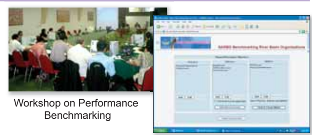
NARBO Benchmarking Service

To stimulate performance improvement of RBOs and allow practical exchange of experience, Performance Benchmarking is carried out among NARBO members. On-line database and web interface for a NARBO Benchmarking Service are being developed.