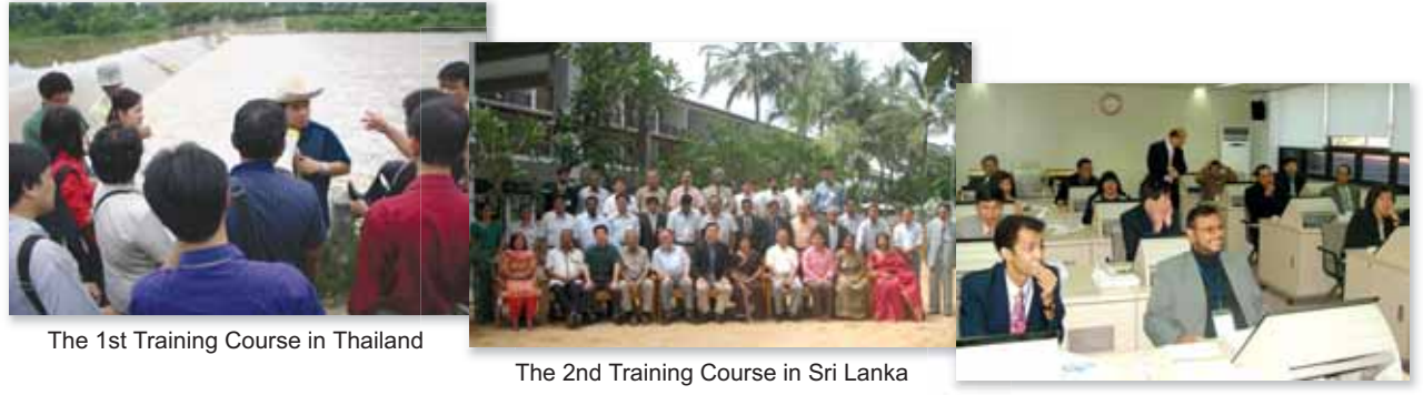
The 3rd Training Course in Korea

Training courses are organized for capacity development of RBOs in implementing IWRM among member organizations. Various training resources on IWRM are provided with taking advantage of a network.