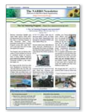
NARBO News Letter

NARBO provides information on IWRM in river basins throughout Asia, such as good practices and lessons learned, are provided.