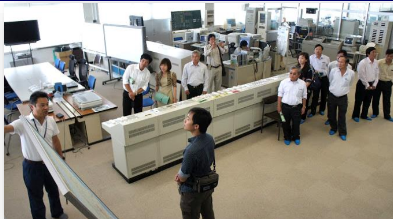
A twinning program