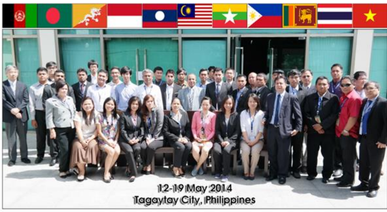
An IWRM training seminar