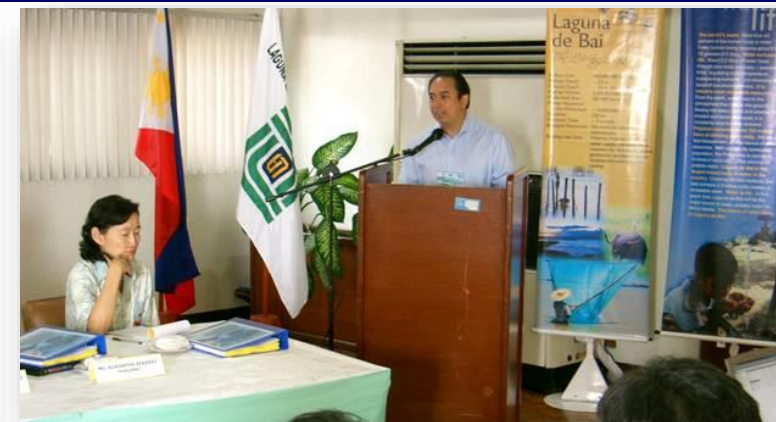
A thematic workshop