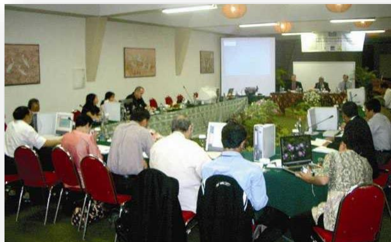
A RBO performance benchmarking meeting