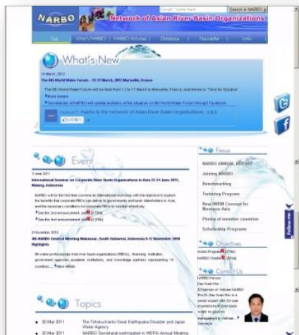
Information sharing (through the website, news letters)